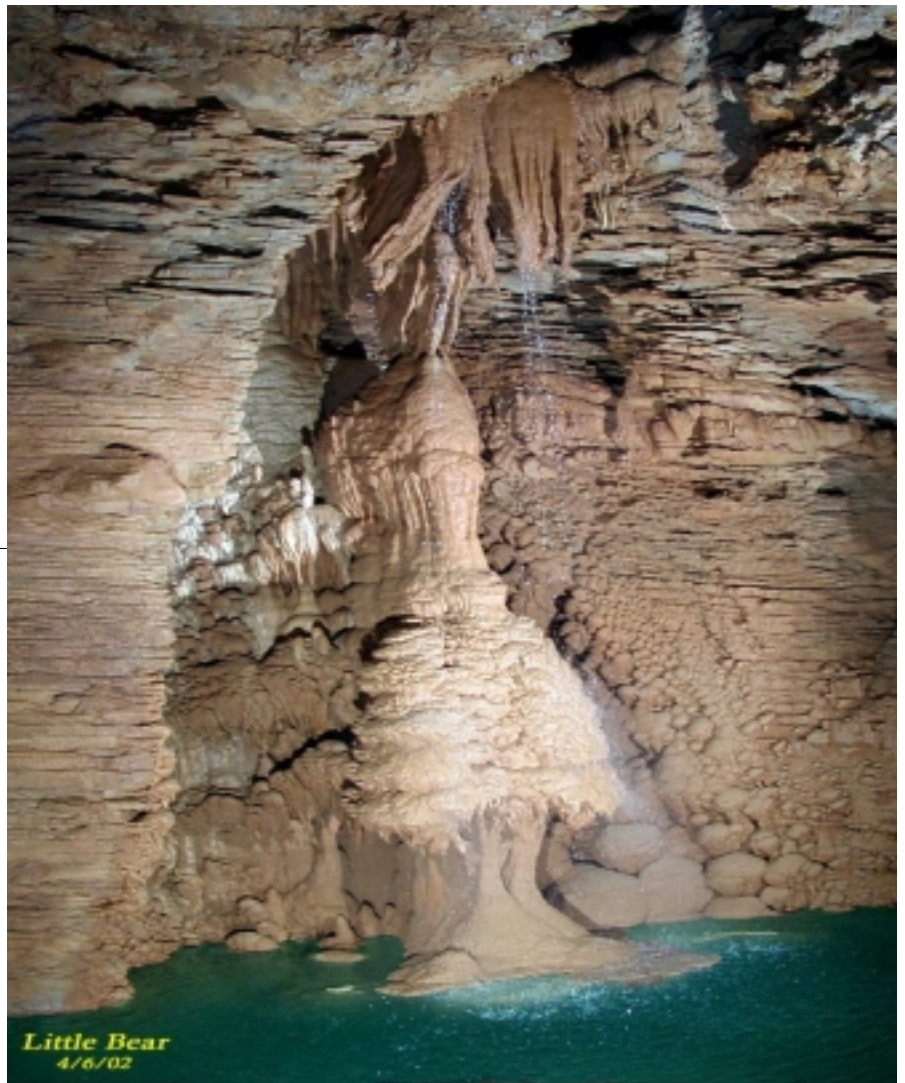
Little Bear Cave