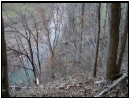
the view from the safety of the ledge I climbed up to. The Cliff is just below. You can see the middle of a large tree showing

(editor's note: Way to go Terry!!! At least I am not the only one Terry tires to stone.)