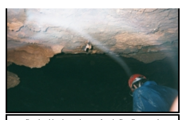
Dead red bat hangs by one foot in Bat Graveyard

http://groups.yahoo.com/group/Restoration_Camp