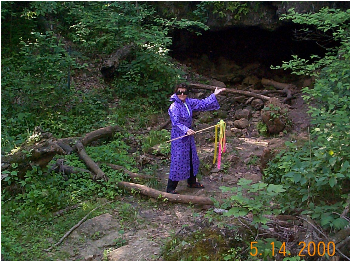
See Elvis Lives